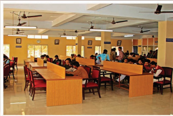
Library Reading Room