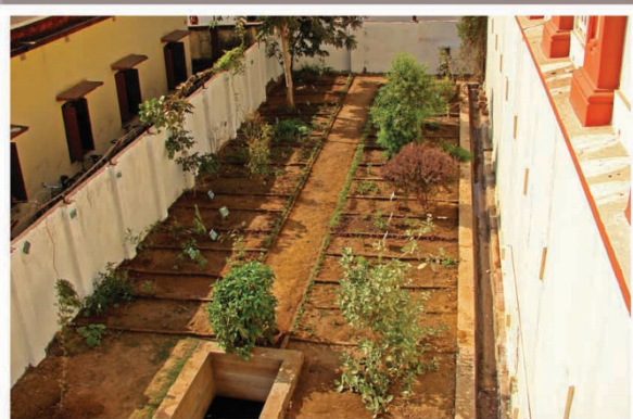
Medicinal Plants Garden