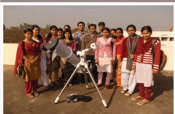
N.C. Rana Sky Observation Center