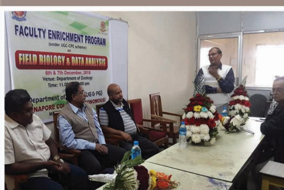
Faculty Enrichment Programme