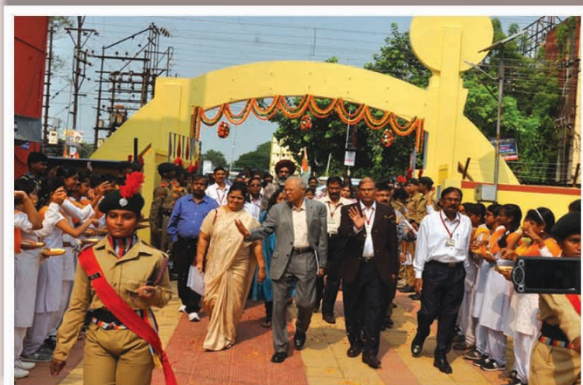
NAAC VISIT -2017