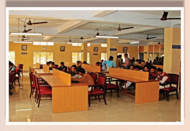
Library Reading Room