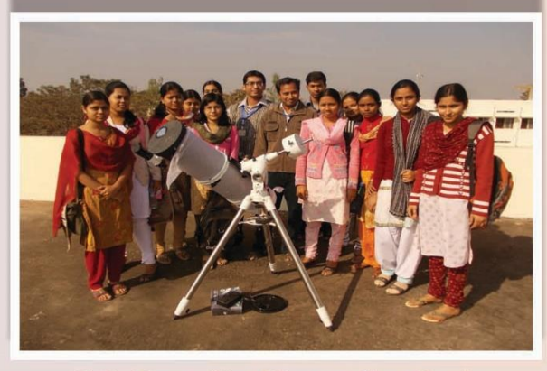
N.C. Rana Sky Observation Center