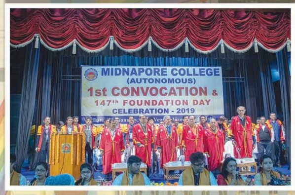
1st Convocation & 147th Foundation Day