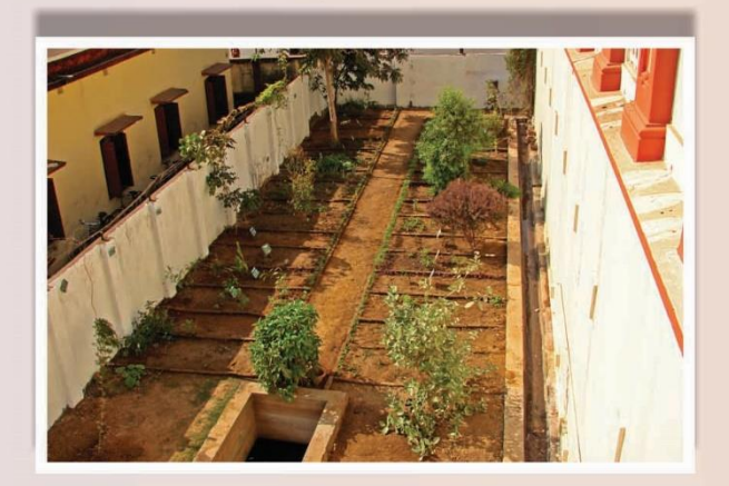
Medicinal Plants Garden