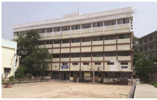
Netaji Janmo Satobarshiki Bhavan