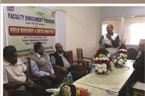
Faculty Enrichment Programme