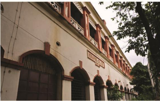
Acharya Prafulla Chandra Roy Bhavan