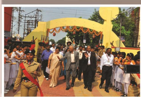
NAAC VISIT -2017