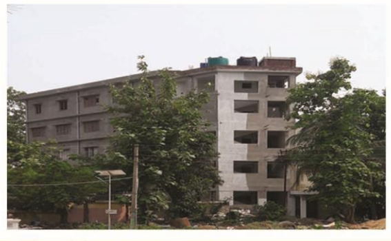
S.N. Bose Bhavan