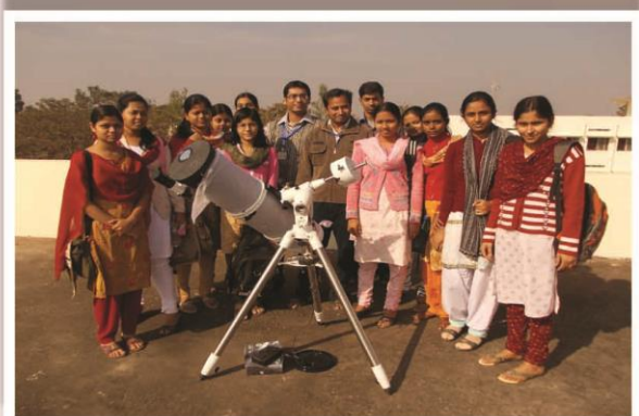
N.C. Rana Sky Observation Center