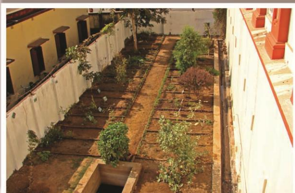
Medicinal Plants Garden