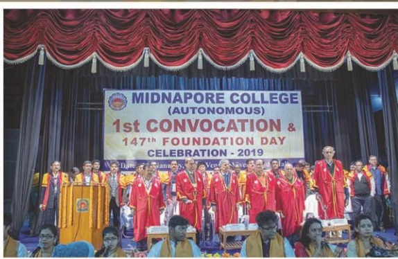
1st Convocation & 147th Foundation Day