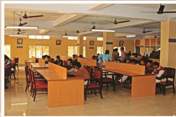
Library Reading Room